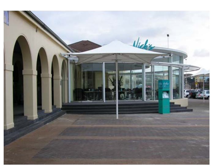
Seen from a distance