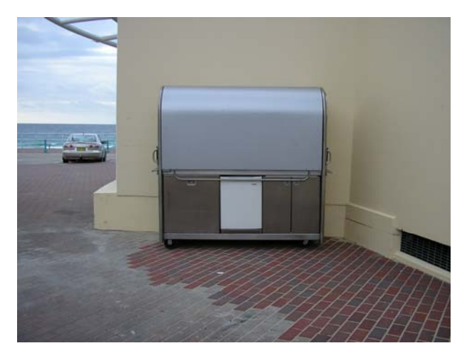
Mobile coffee maker kept behind building