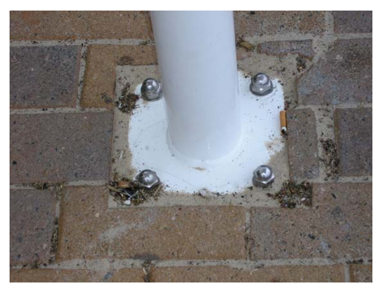
Nick's Café – Bolt plate set into promenade and secured with bolts – These bolts require bolt threads cemented into concrete and the tops tightened – <u> Permanent </u>.