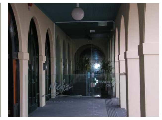
Glassed off section (closer shot)