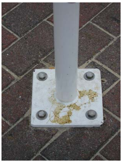
Lusher's Bar Gelato – Bolt plate sitting above promenade with bolts screwed into the promenade – Temporary .