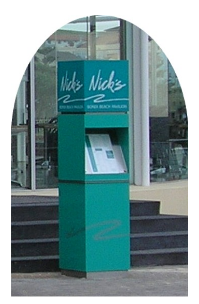
Permanent menu cannister