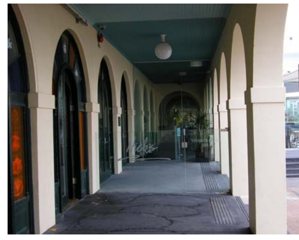
Glassed off section (1)